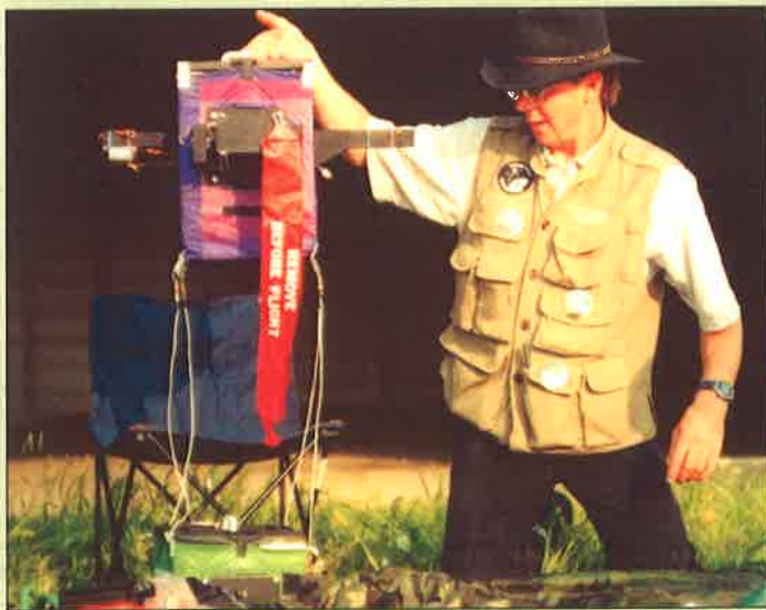
The author lifting the module of one of his near spacecraft. The second module is green and can partially be seen in the grass. The "Remove Before Flight" tag is a reminder for launch crews to open the camera before launching the mission.

else can you practice what it takes to build and launch a spacecraft?