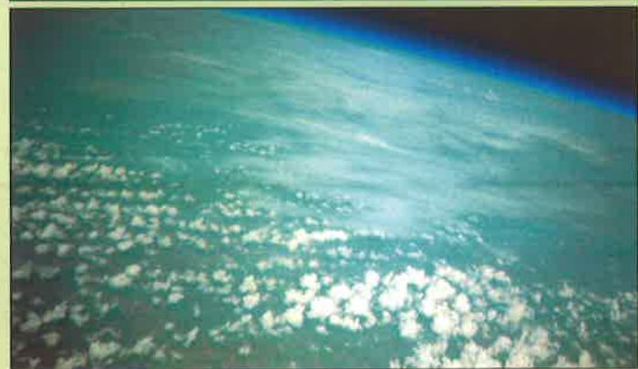
The Earth, photographed from an altitude of 86,000 feet. Sensors on this mission indicated that the air temperature was nine degrees Fahrenheit at the time. The distance to the horizon was calculated to be 360 miles. Beautiful clouds of fair weather cumulus, marching in rows, fill the scene.

Don't forget the onboard GPS receiver, as it, too, is a part of the weather station. I use data from a GPS receiver to determine the direction and speed of the wind at various altitudes. With this data, I can measure the speed and altitude of the jet stream for myself. On near space missions, hobbyists make the same measurements that the National Weather Service does with its 100 daily radiosonde launches.