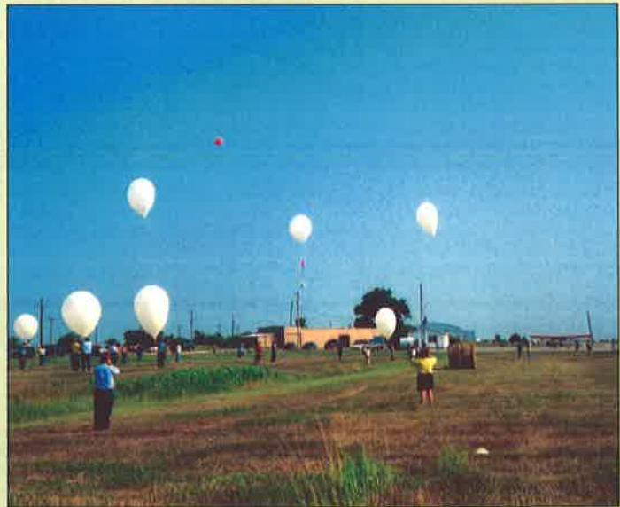
Six stacks are about to be launched. You'll actually count eight balloons because of the red piball (pilot balloon) and the extra balloon on Don Pfister's stack. The piball was launched by EOSS to gauge wind speed and direction before GPSL 2002 launched.

The cost of a near space pro- MARCH 2004