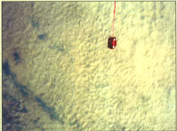
An example of a reusable lunch bag-based airframe. Mark Conner's (N9XTN) module is seen being suspended about 10 feet below my module, which provides the tracking services for this flight. Tens of thousands of feet separate the clouds from this near spacecraft.

Do you want to know the air temperature, pressure, and relative humidity found in near space? If so, then launch a lightweight weather station. A pressure sensor will show that the atmospheric pressure decreases by a factor