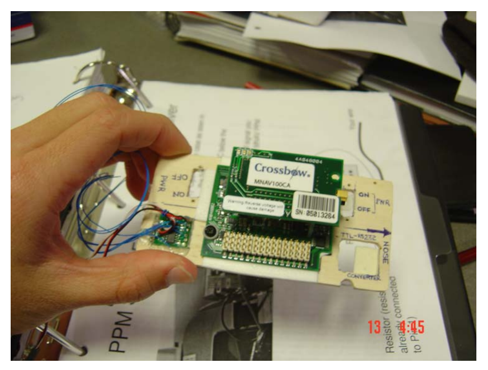
Figure 1 MNav with adaptor board

Figure 4 shows the 2 balsa wood that is glued to the carbon rod of the Yard Stik which is used to attach to the data modem. Figure 5 shows the assembled modem on the Yard Stik airframe.