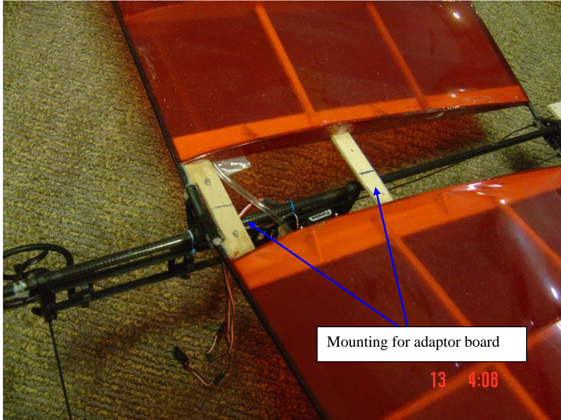
Figure 2 Mounting for sensor adaptor board