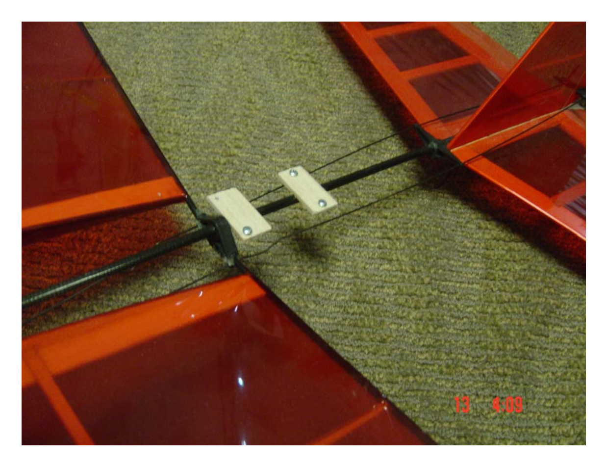
Figure 4 Mounting for the modem